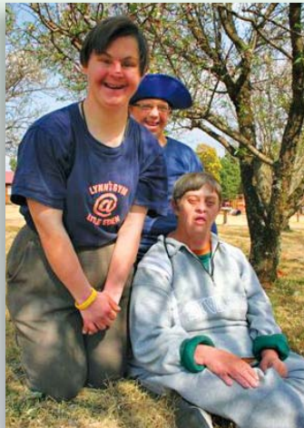
(Left) Spring has come to the orchard at the Village and the peach trees are covered in pink blossoms.