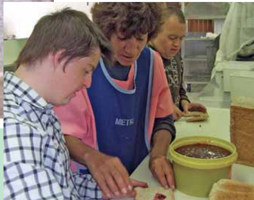
Lots to do on the Farm: horseriding, playing in the labyrinth and helping in the kitchen.